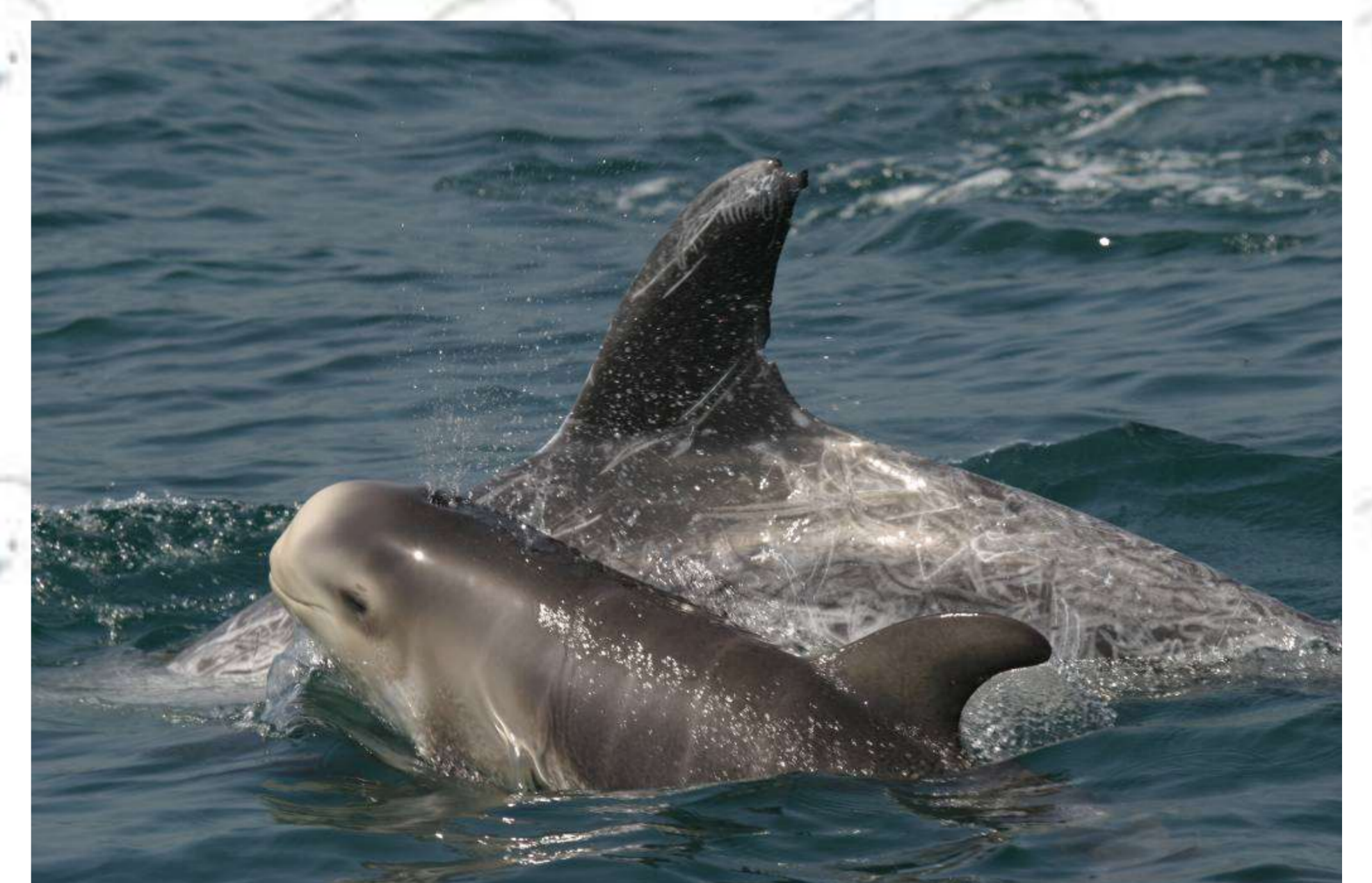
Figure 3. Mother and calf sighted in Banco del Hoyo (SE Gulf of Cadiz), interacting with fisheries.