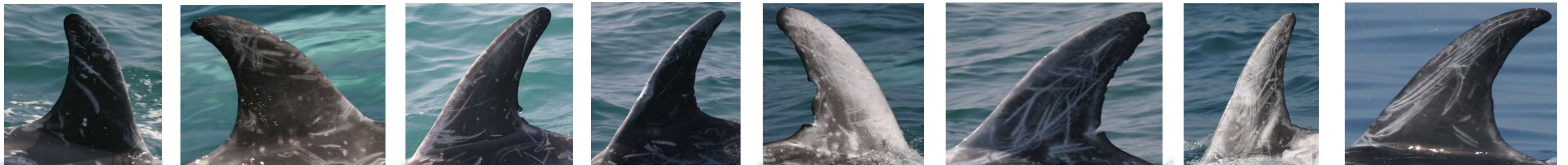
Figure 1. Examples of the individuals identified in the photo-ID catalogue.

From 2001 to 2010, more than 33,000 km of effort and a total of 19 sightings were realised in the Southwest Iberian Peninsula. Along the Spanish coast, data came from dedicated research surveys while along the Portuguese coast, data were obtained from whale watching boats (see poster D27). In all the encounters, photo-identification pictures were taken to build a catalogue of Risso's dolphin.