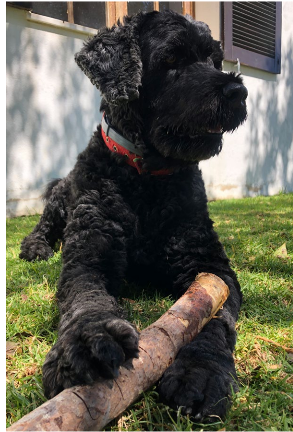
Scuba, the fluffiest teammate